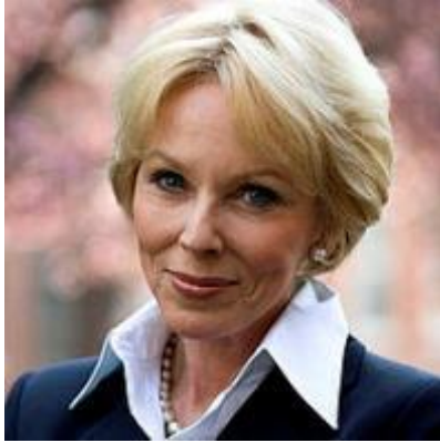
Bernardine Healy 1944-2011